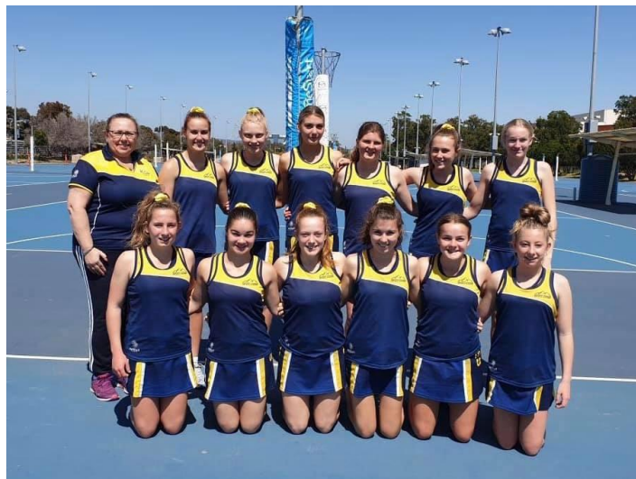
Central Ranges Division 1

The 2020 program is set to commence in February with selection trials with information available from Central Ranges Netball Academy Facebook page as well as BLGNA association and TNC club correspondence.